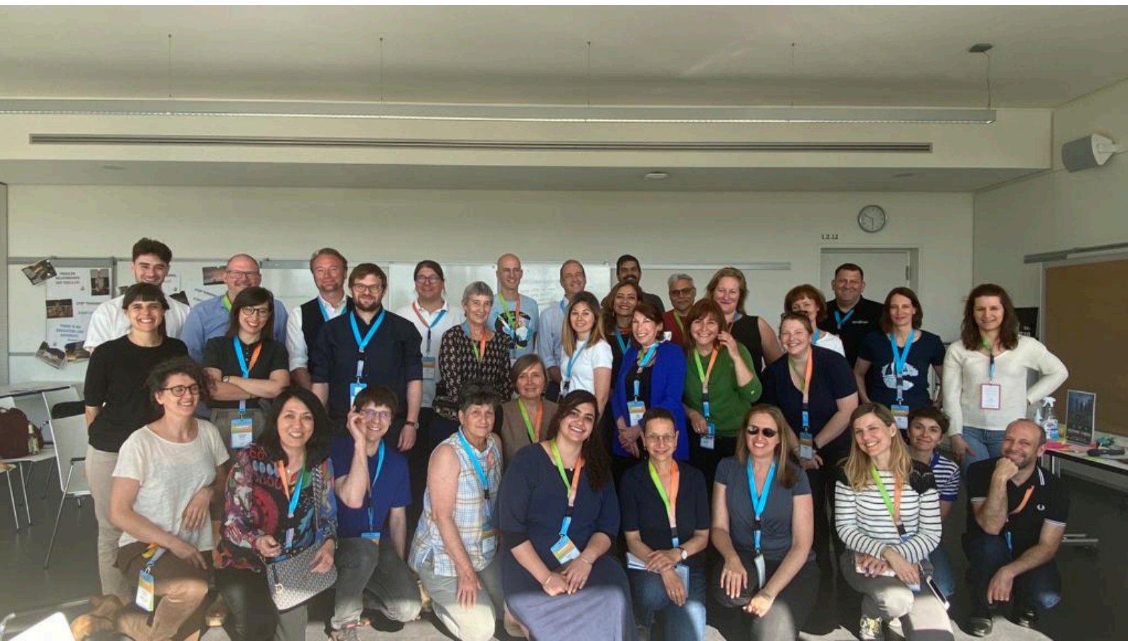
OStogether pre-conference workshop at Ecsite2022